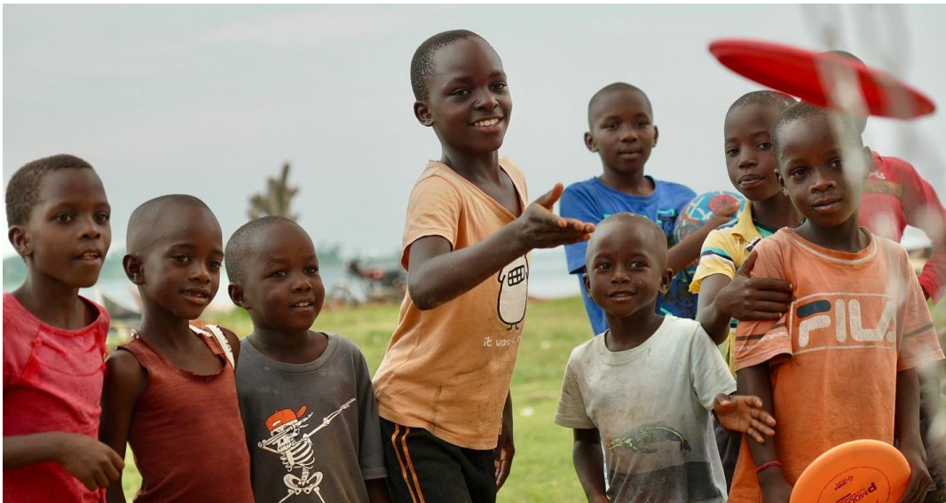
Beneficiaries of the Paul McBeth Foundation Project in Katosi, Uganda, supported by PDGA.

This policy allows players with disabilities to apply for rules exemptions where such exemptions may allow them to participate in PDGA-sanctioned events where they otherwise could not. Rules exemptions will be provided on an annual basis requiring resubmission each year and will not be provided for injuries that are temporary in nature, such as a recoverable injury. See: https://www.pdga.com/medical/reasonable-modification-request . In addition, in 2023 the PDGA announced an Appendix to the Rules of Play covering Adaptive or Wheelchair athletes. For more information see: https://www.pdga.com/news/adaptive-rules-disc-golf .