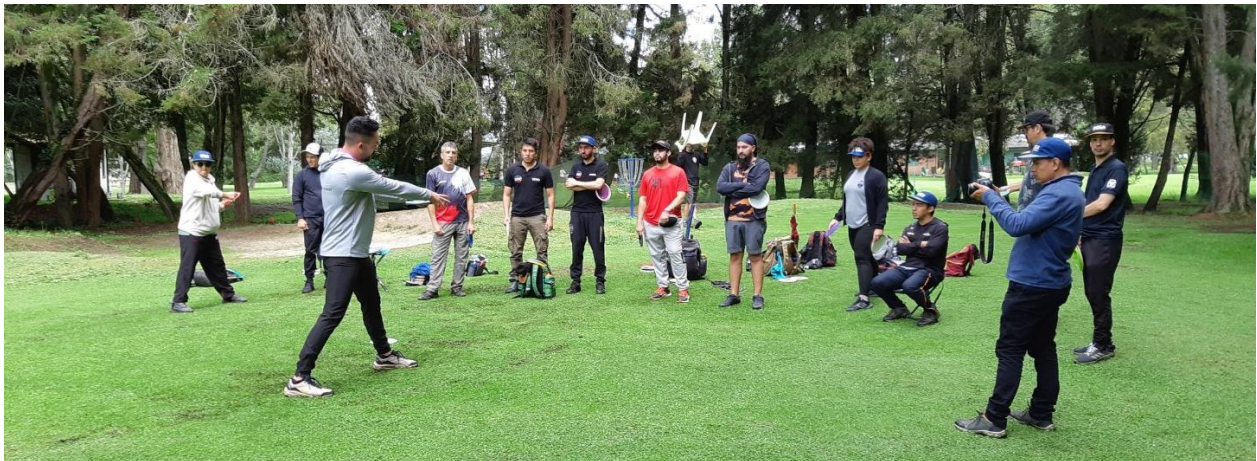
Training of Trainers Workshop in Bogotá, Colombia, November 2024