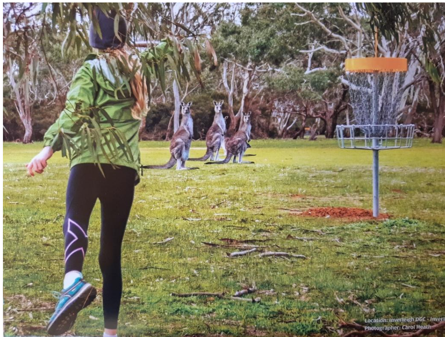
Kangaroos study the art of putting at Australia's Inverleigh course

Countries interested in becoming affiliated can contact the International Director or PDGA Europe for more information.