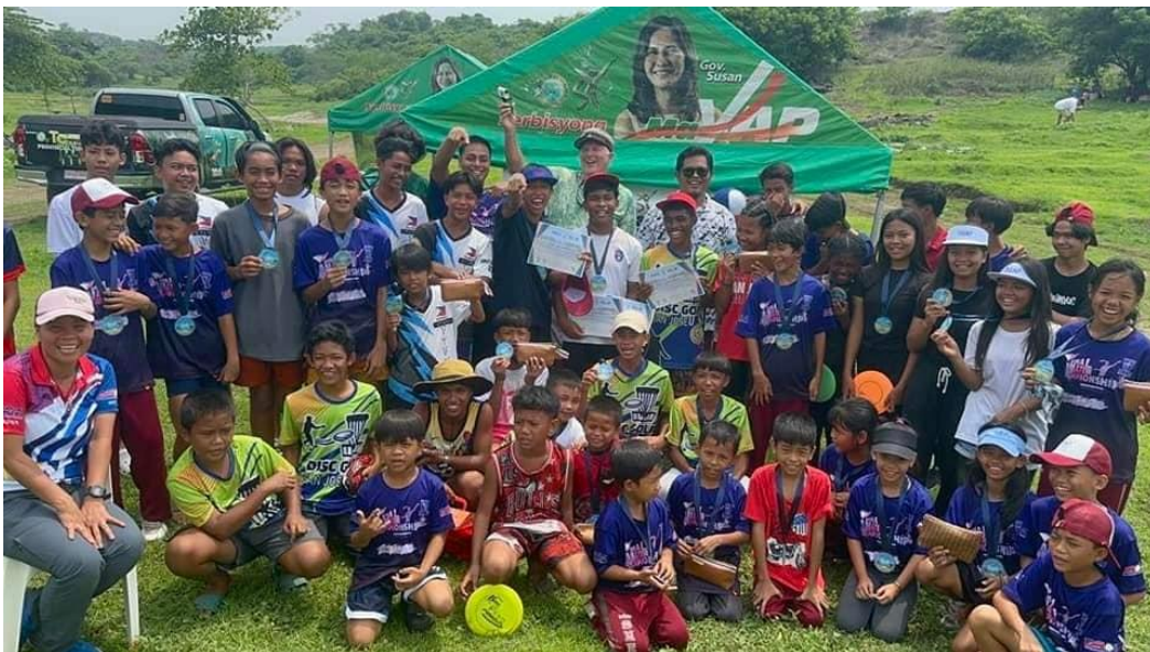
Philippines Junior Event Participants