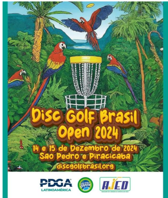
Event Promotion Posters from Mongolia & Brazil