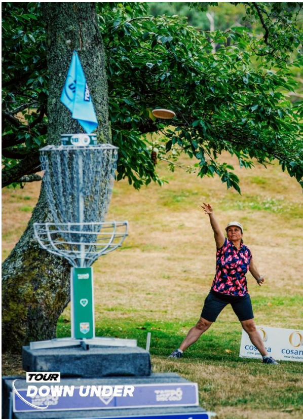
Basket hunting at the Taupo Classic in New Zealand

3 Object targets are allowed under XB and XC Tier events, but this must be specified when filing the sanctioning agreement.