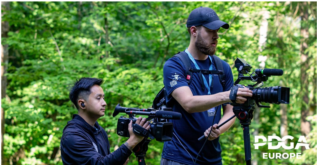
Heatland & Pulsea media team members filming at the Swedish Open