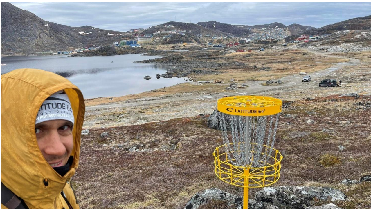
In 2023 Denmark's Martin Spliid & Latitude 64 organized the 1 st course installations in Greenland