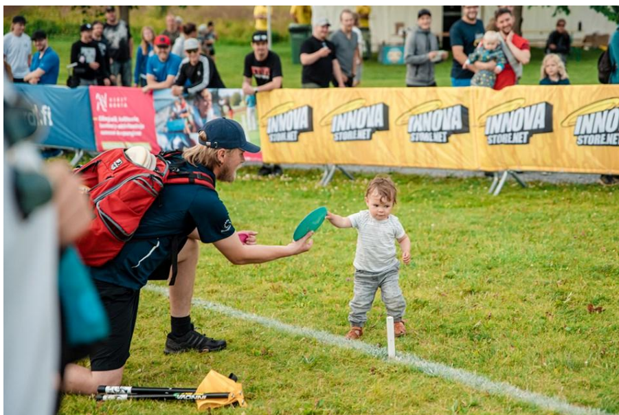
Disc Retrieval at the European Open in Nokia, Finland

Join the PDGA. The professional association for ALL disc golfers!