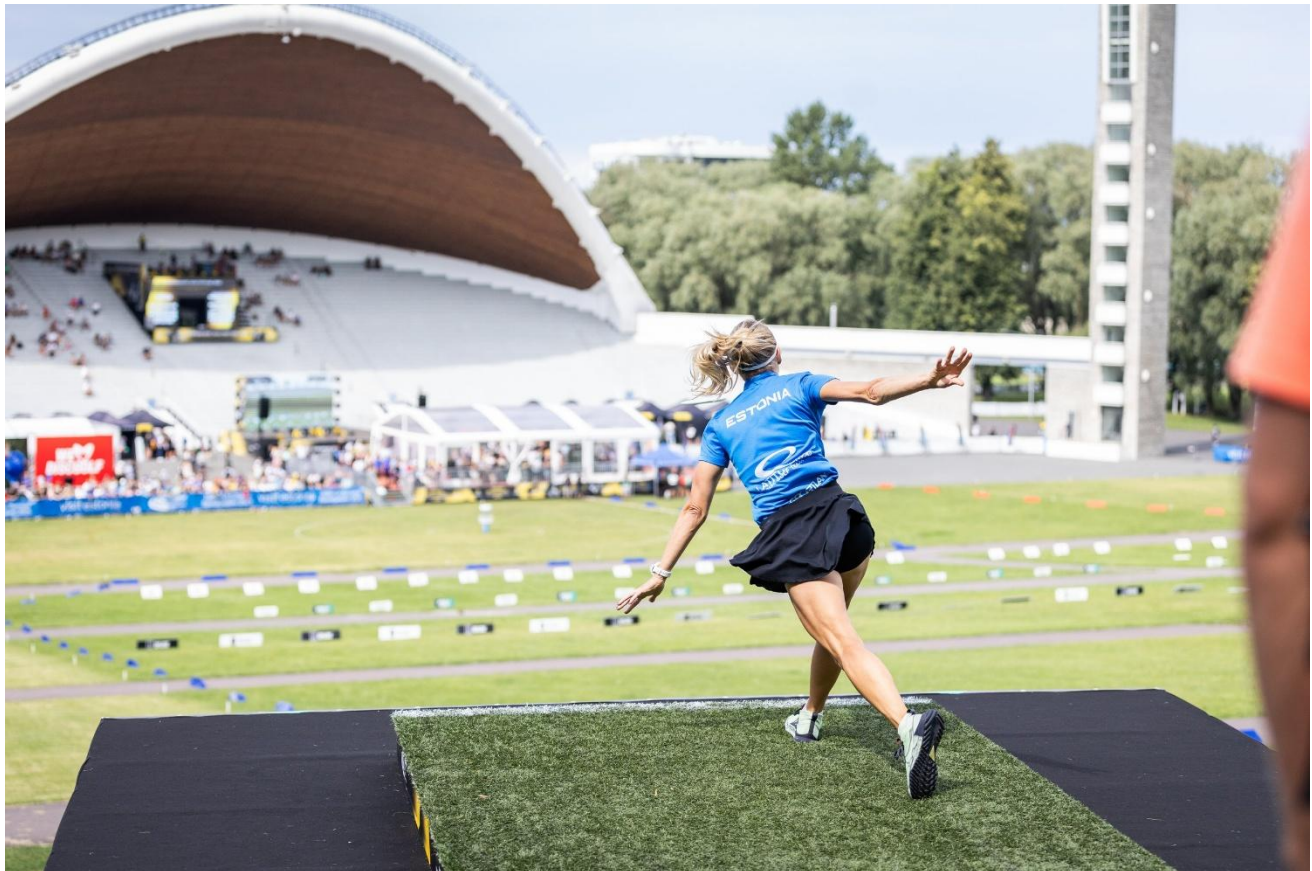
The European Disc Golf Festival in Tallinn, Estonia will be a PDGA Pro Major in 2025.