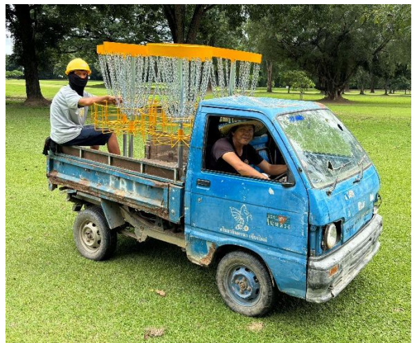
Locally made baskets delivery in Thailand