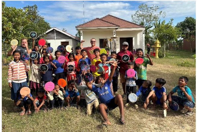
In 2023 and 2024 the PDGA donated & shipped more than 7500 discs to developing world countries