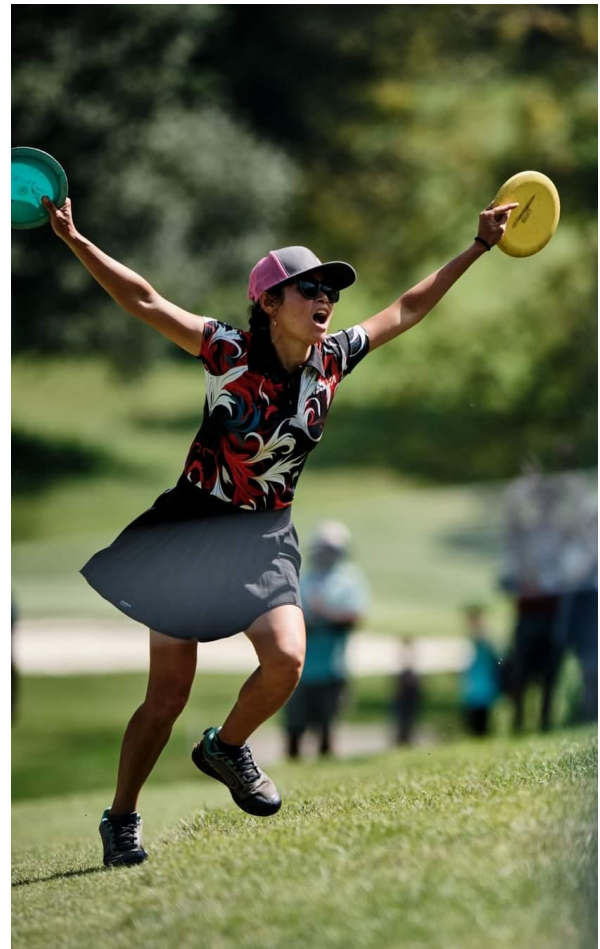
Laotian-American Ohn Scoggins is the 4 time defending FP40 World Champion.