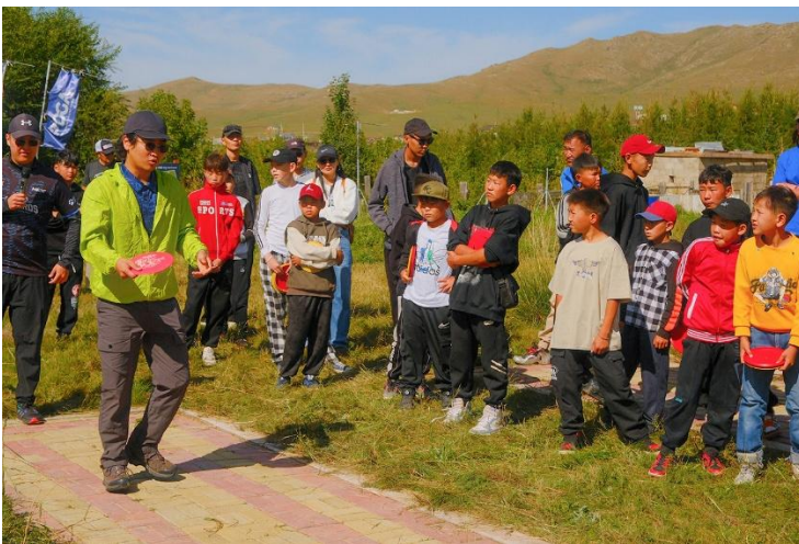
Teaching the basics in Mongolia