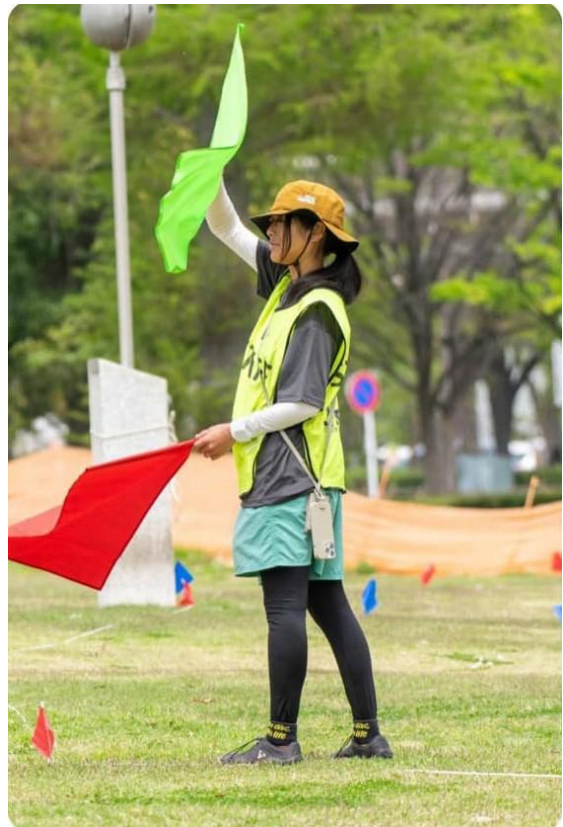
A Spotter makes the Call at the Tokyo Open