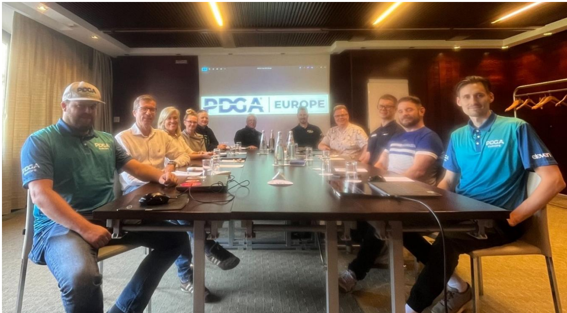
PDGA Europe Summit Attendees, Milan, Italy, November 2024.