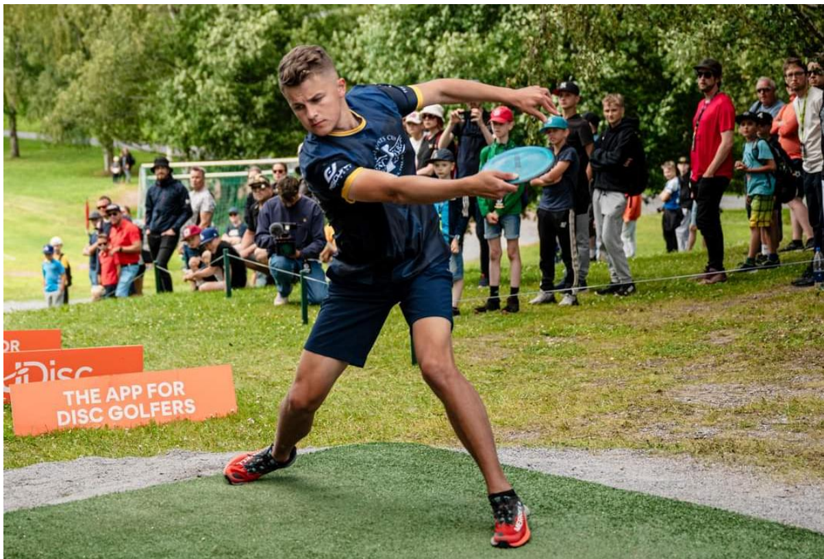
Finland's Niklas Anttila is Europe's top ranked & rated male player