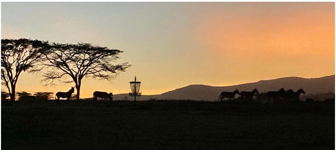
Sunset over the Rimpa Wildlife Conservancy near Nairobi, Kenya