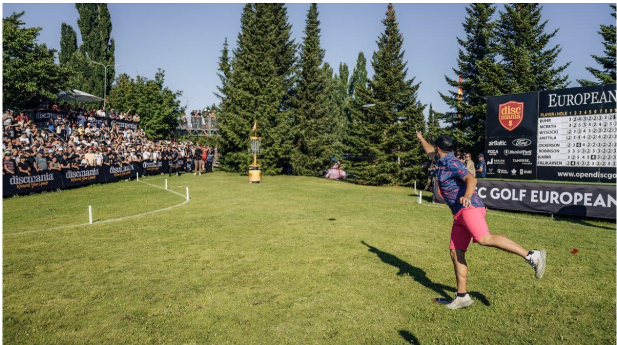
2025 PDGA Pro Worlds will climax at the infamous Beast course in Nokia, Finland