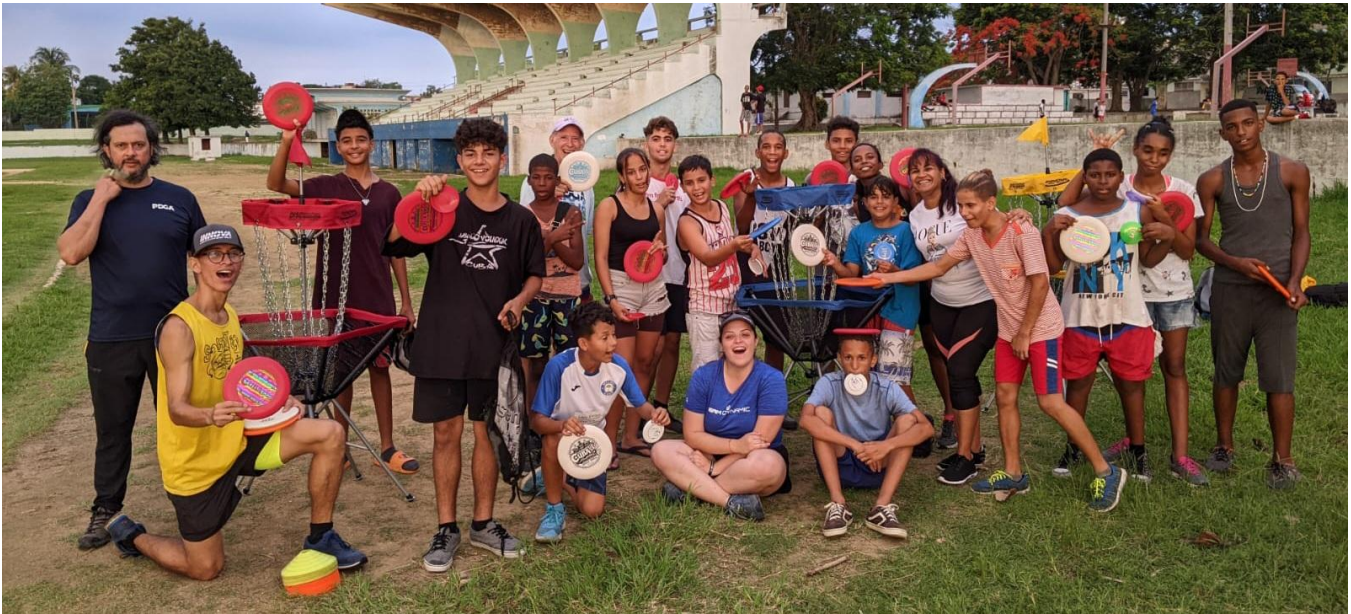
Marco Polo Program in action: Introducing the game in Cuba

For more information on the Marco Polo Program, including the Application Form and examples of Project Reports from recipients to date please see: http://www.pdga.com/marco-polo-program .