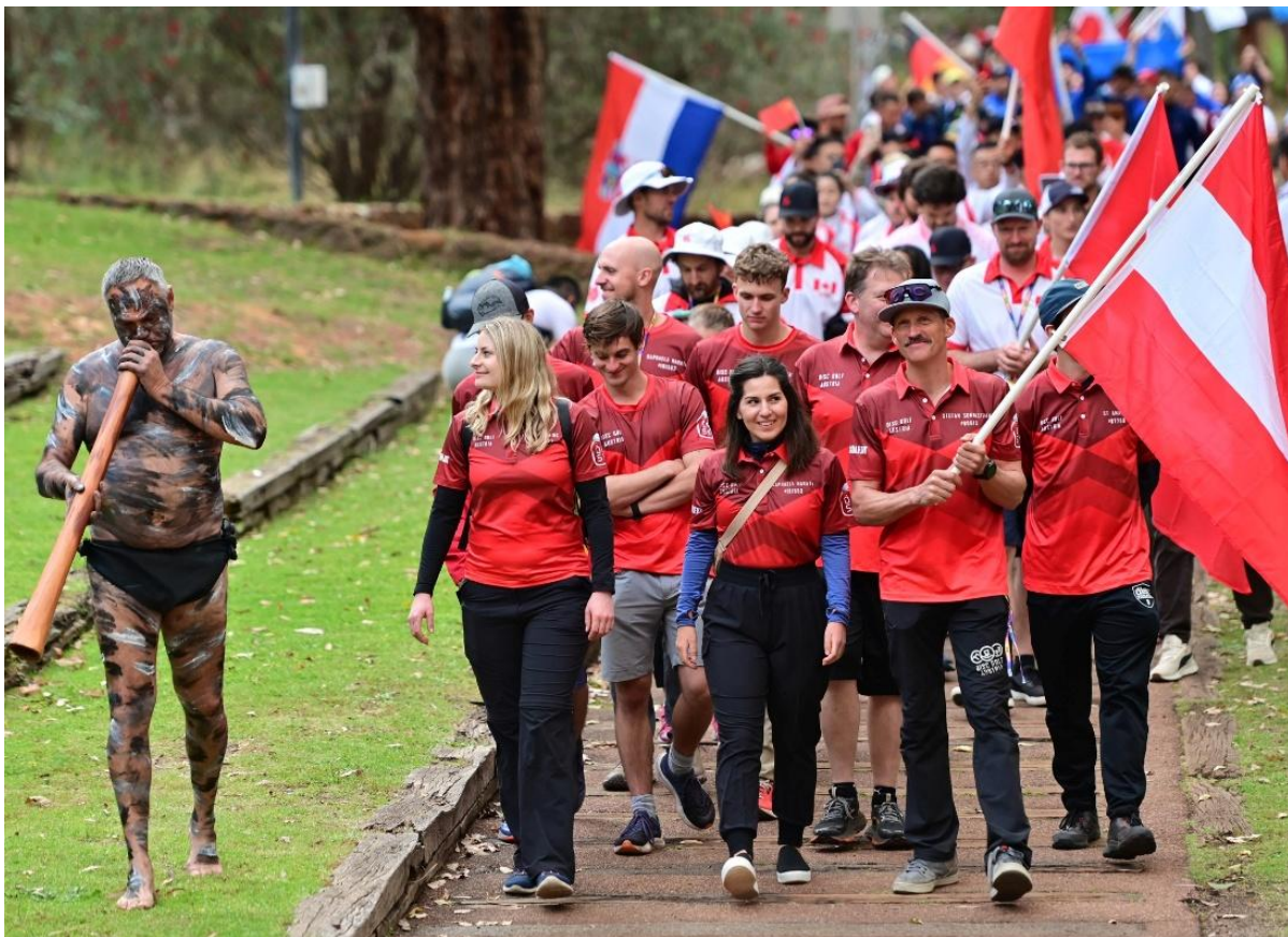
2024 WFDF World Team Championships Parade of Nations

The WFDF World Team Championships are held every 2 years. The 2024 edition in Western Australia drew 23 countries, with Estonia winning Gold for the 2 nd time running, Australia Silver and Canada Bronze. The 2026 edition will be held in Lithuania. For more info: https://wdf.sport/